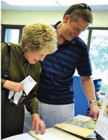
Reliving history at the 50th Anniversary