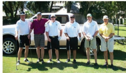
Golfers at the Battle Against Autism