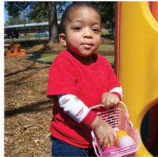
Easter egg hunt