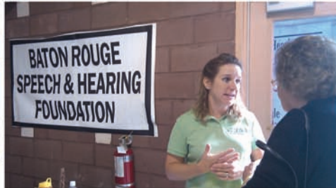
Discussing Hearing Health on Audiology Outreach trip