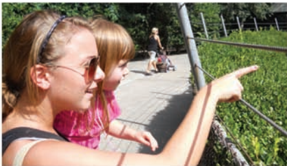
Learning about animals at the zoo