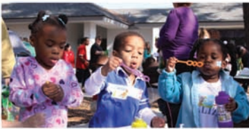
Blowing Bubbles at Animal Fun Fair