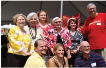
Former teachers & students at the 50th anniversary